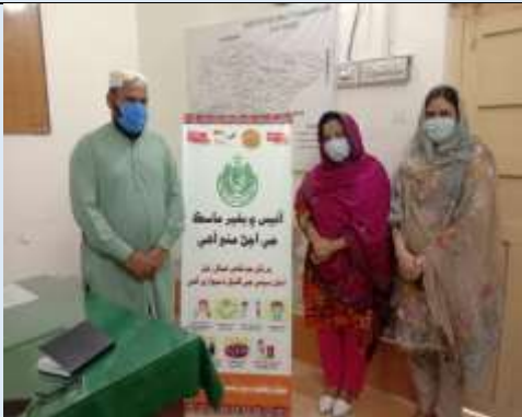
COVID_19 Social-Distancing Sessions at District Khairpur