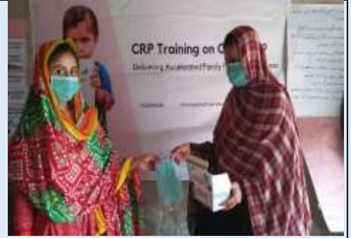
CRPs Training Sessions on COVID-19 under PSI-DAFPAK Project at Shikarpur