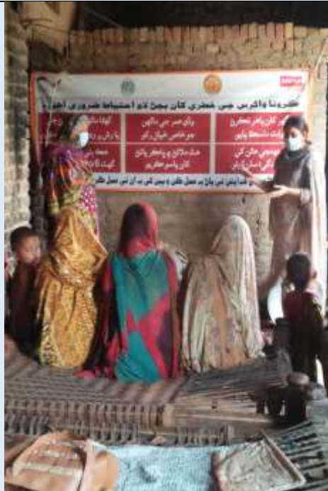
Under HelpAge Project COVID-19 session at District Shikarpur