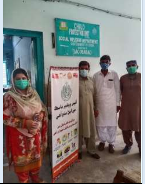
IEC material Displayed at Child Project – SWD-Jacobabd