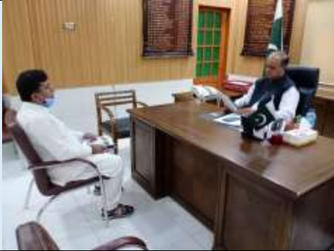
Community sessions at District Badin