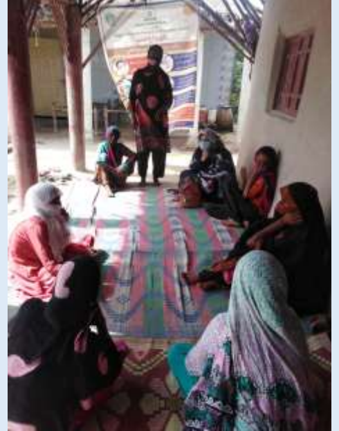
District Mirpurkhas Sessions