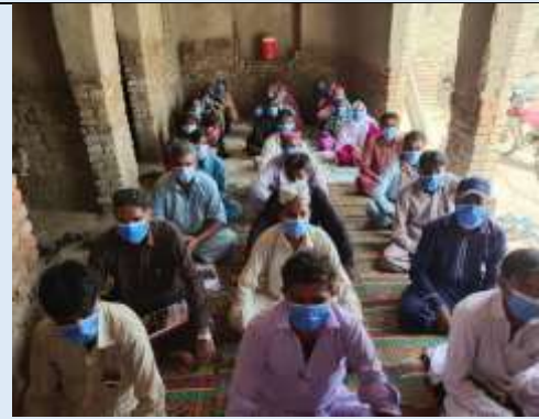
COVID-19 standies handed over to DD Social welfare department Shikarpur