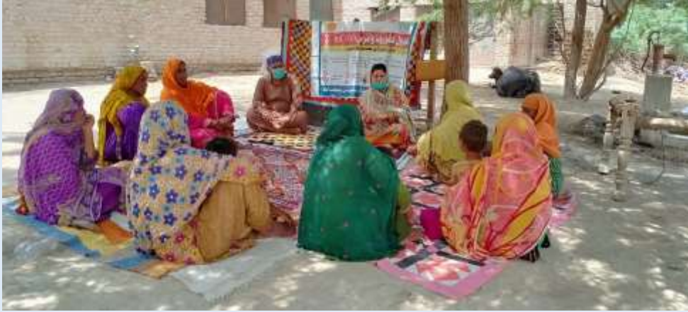
COVID-19 Community session at District Jacobabad